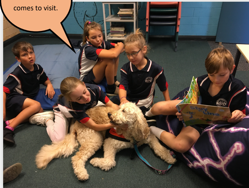
Daisy dog sometimes comes to visit.